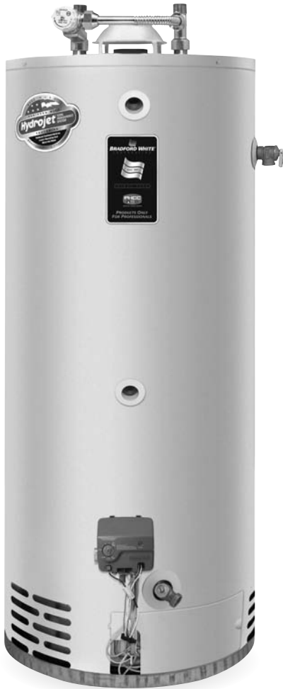
Photo is of C-DW2-75T10BN