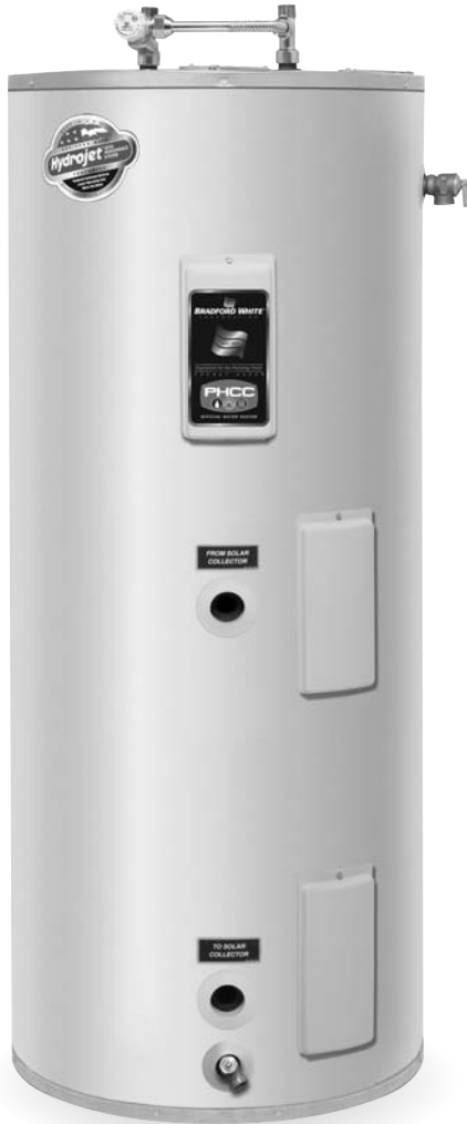
Photo is of S-SW2-60R6DS