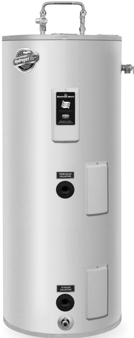
Photo is of S-SW2-60R6DS