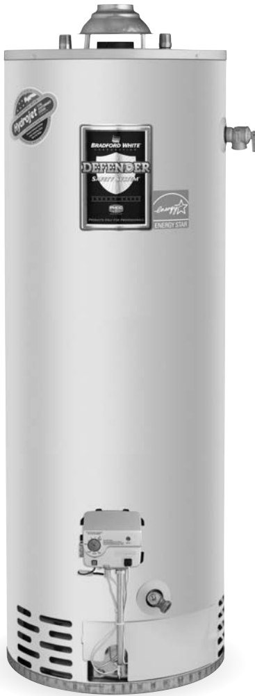
Photo is of M-4-40T6FBN